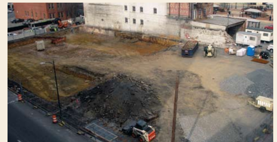
RRTA Transit Station expansion and garage.

These public infrastructure projects, in addition to the $12 million renovation to Lancaster's historic Amtrak Station and the $17 million RRTA garage and bus station project at Queen and Chestnut, are essential investments in the community's future.