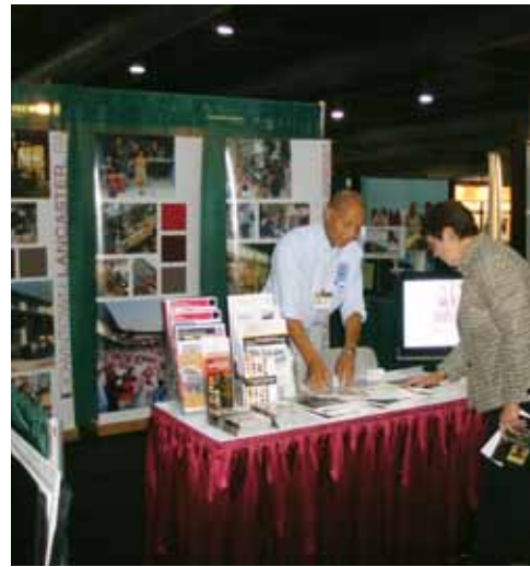
Downtown Lancaster booth at ICSC.