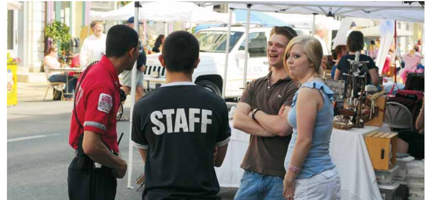
A JSID Bike Squad member engages participants at the 300 N. Queen St. block party.

One message we heard through our summer outreach is some confusion over the roles and responsibilities of the bike squad. Are they security or ambassadors? When should I talk to them and what can they do for me?