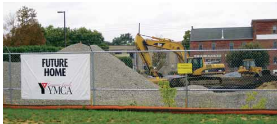
Construction underway for new YMCA facility.

Excavators and dump trucks are yet again re-shaping the Harrisburg Avenue corridor as the YMCA's new facility is under construction at 265 Harrisburg Avenue. Scheduled to open in Fall 2009, the new YMCA will be a phenomenal community asset, offering a wealth of activities for Lancaster's youth and adults, a six lane indoor competition pool, a running track and full-court gymnasium. The 42,000 square foot, 3-story new building will be a prominent addition to an increasingly vibrant gateway corridor that just five years ago was dominated by warehousing and distribution activity.