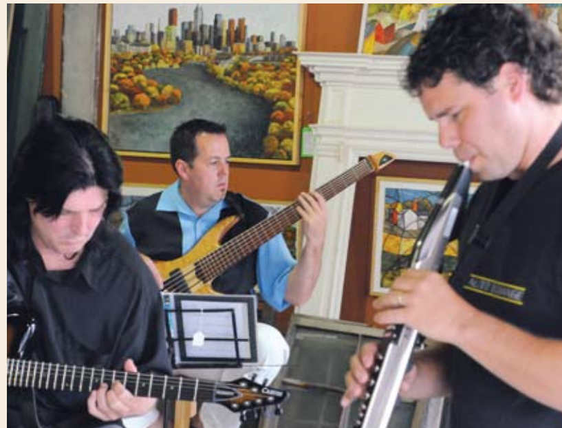
Music Friday performance at BUILDING CHARACTER.