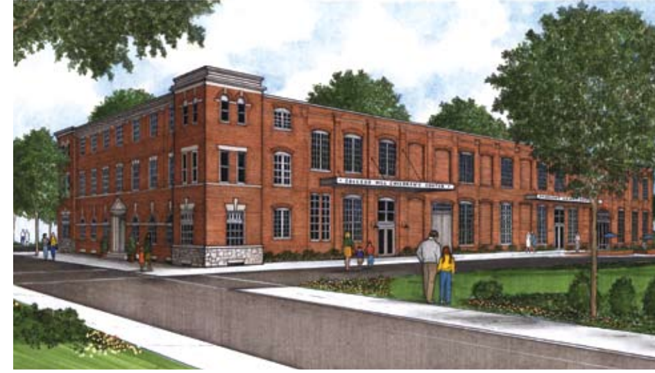
College Hill Children's Center and the LIFE Center is scheduled to open in mid-August.

Work is nearly complete at the new College Hill Children's Center and the LIFE Center, an Albright Care Services eldercare facility, at 417 W. Frederick Street, just off Harrisburg Avenue between Lancaster Avenue and Charlotte Street. The $7.4 million project is being developed by Radnor Property Group and Silverang Hallowell Development Company in collaboration with Franklin & Marshall College, Lancaster General and Albright Care Services. The project required the demolition of a 30,000-sq.-ft., 4-story property and the rehabilitation of a 100-year-old tobacco warehouse. Both the childcare and eldercare facilities are scheduled to open in mid-August.