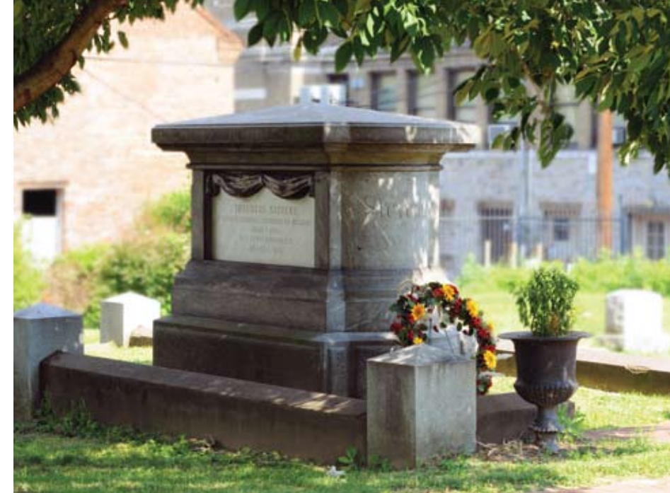
Gravesite of Thaddeus Stevens.