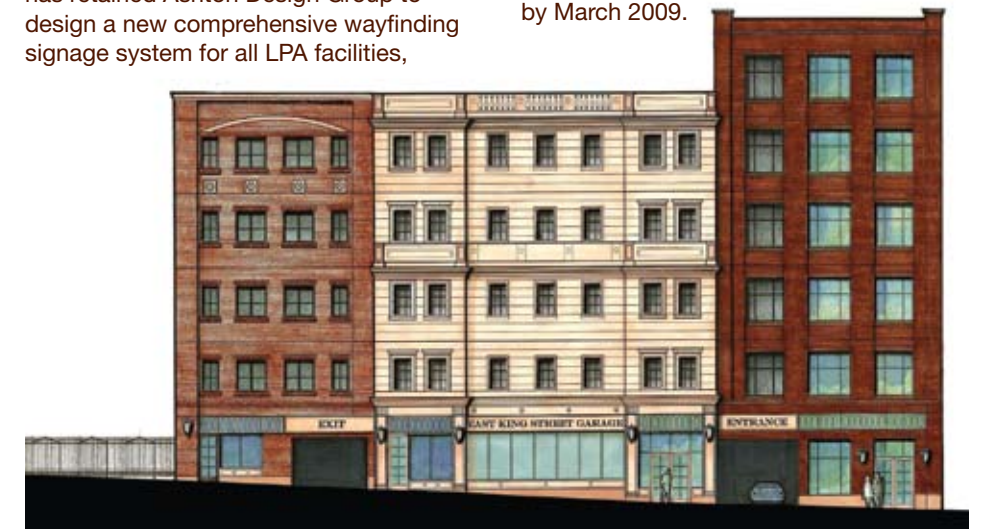
East King Street Garage (Rendering Courtesy of MM Architects & LPA)

with the new East King Street, the newly renamed Penn Square (formerly King Street) and Prince Street garages first in line to get the new signage packages by March 2009.