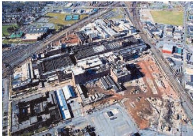
Aerial photo shows progress on Armstrong site demolition.

The demolition process has resulted in some impressive statistics already, even before the majority of major buildings on the site have been torn down. The partnership overseeing the project, comprised of Franklin & Marshall College, Lancaster General Hospital and