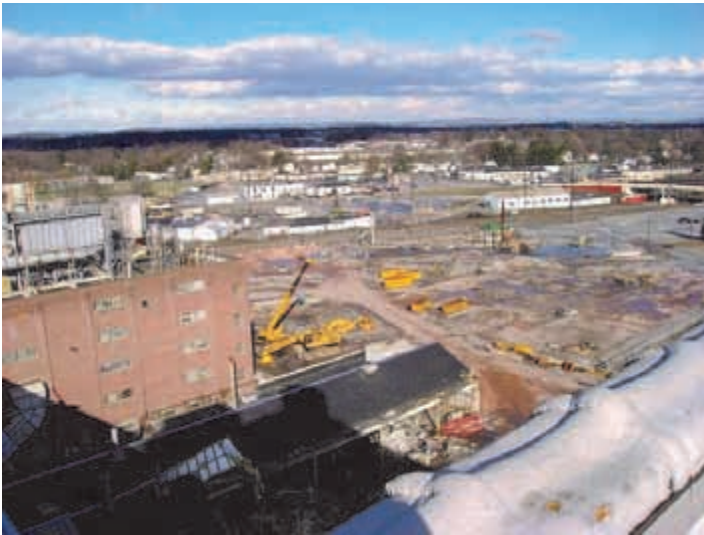
Demolition contractor Brandenburg makes progress at the site.

The most visible components of the Armstrong redevelopment project, the demolition of more than 200 buildings on the site, is well underway with two sections of the 47-acre area now complete. The demolition of the largest structures, a 6-story and 10-story building, is expected to be