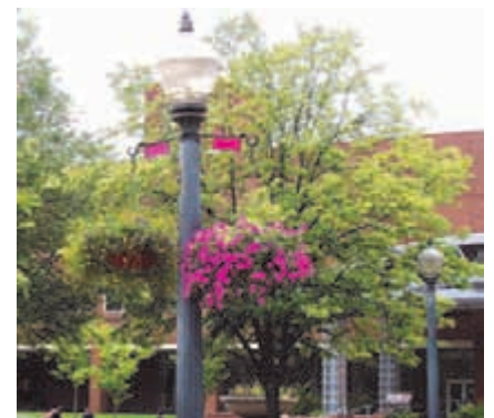
Example of a pedestrian light fixture

Special thanks to PPL Electric Utilities and the City of Lancaster for their quick response and hard work on this project.