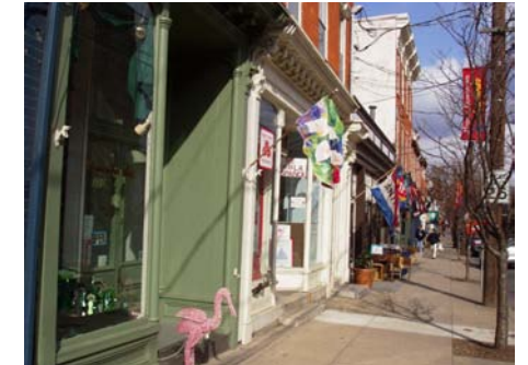
300 block of North Queen Street

The community is already gearing up for its annual Uptown 300 Block Party. Mark your calendars for the celebrations which kick off at Noon on Saturday, June 4, 2006. The event includes live music, food, arts and crafts, and antiques.