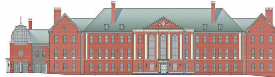
Rendering of Franklin & Marshall College's Barshinger Life Science and Philosophy Building currently under construction.

Franklin & Marshall College has a full plate of real estate activities underway or planned for the near future. Under construction in the middle of campus is the College's new Ann & Richard Barshinger Life Science and Philosophy building, the largest investment in an academic structure in the College's history. The $45 million, 100,000 s.f. building will house the Biology, Psychology and Philosophy departments and is expected to be completed in Fall 2007. The Life Science and Philosophy building site used to be home to the College's tennis courts, which are now being rebuilt across Harrisburg Avenue where the Kimmel scrapyard used to be located.