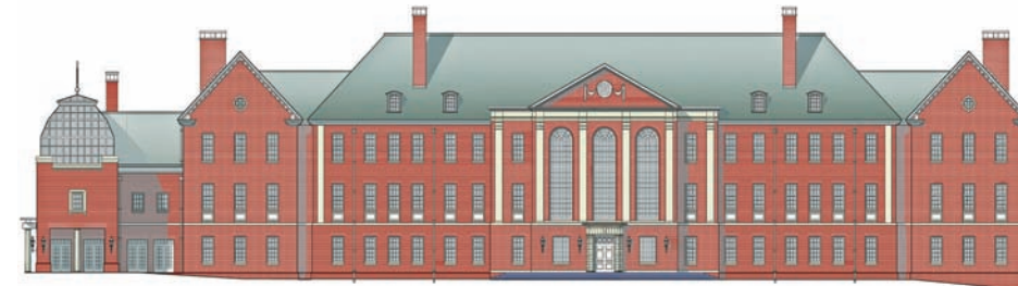
Rendering of Franklin & Marshall College's Barshinger Life Science and Philosophy Building currently under construction.

Franklin & Marshall College has a full plate of real estate activities underway or planned for the near future. Under construction in the middle of campus is the College's new Ann & Richard Barshinger Life Science and Philosophy building, the largest investment in an academic structure in the College's history. The $45 million, 100,000 s.f. building will house the Biology, Psychology and Philosophy departments and is expected to be completed in Fall 2007. The Life Science and Philosophy building site used to be home to the College's tennis courts, which are now being rebuilt across Harrisburg Avenue where the Kimmel scrapyard used to be located.