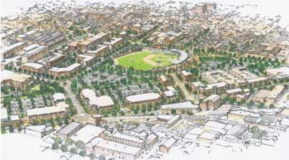
Aerial view illustrating the proposed vision for Harrisburg Pike

The James Street Improvement District has taken the lead in developing a vision plan for the area around the planned Clipper Magazine Stadium. Pictured above is a view depicting what the future may hold for Harrisburg Pike and Prince Street. View the entire Lancaster City Stadium District Physical Environment Vision Report (December 2003) by entering our website at www.jsidlancaster.org .