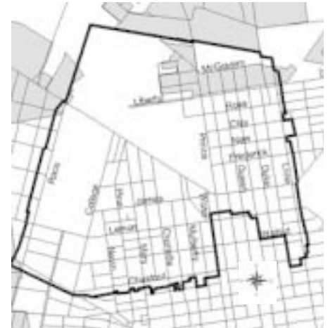
James Street Improvement District Boundaries

The JSID is a non-profit organization created to enhance the quality of life for residents, businesses and visitors in the Northwest neighborhoods of Lancaster City.