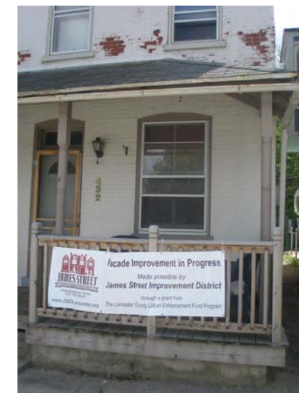
Participating property on W. Frederick Street

all of the grant funds available. Property owners have six months to complete the work, so the JSID expects that the majority of projects will be done by early Fall 2011. Special thanks to Cox Evans Architects and Thomas Comitta Associates for their pro-bono design work supporting this effort. Look for a summary report in an upcoming newsletter showcasing various improvements and the combined total investment.