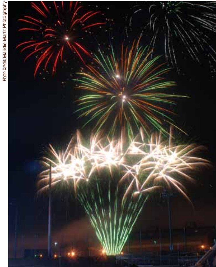
New Year's fireworks at Clipper Magazine Stadium