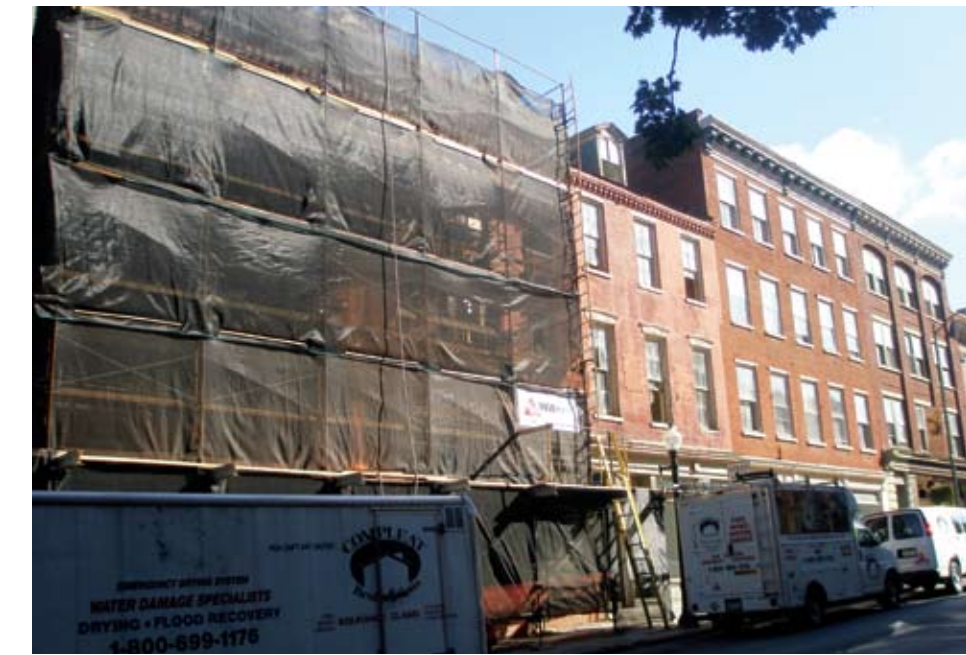
Historic East Side Suites — In-fill project under construction on E. King St.

This approach isn’t new thinking. In fact, it aligns with national best practices and follows on solid planning work already done in Lancaster City, including the pivotal LDR plan of the 1990s and more recent work done by The Brookings Institution. It also is realistic given a considerably different and more challenging economic environment. The City has seen an enormous wave of investment, with more than $800 million in completed projects since 2005, many of